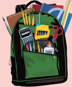
Backpack & School Supply Drive

Donations due to CUMC Office by Tuesday, August 14 th !