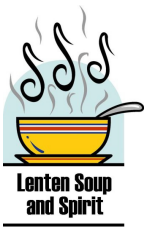
Lenten Soup and Spirit