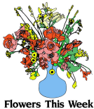
Flowers This Week