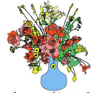
Flowers This Week

Our 2018 Calendar is now available! Please sign up on the calendar outside Jeff's office.