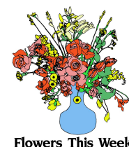
Flowers This Week