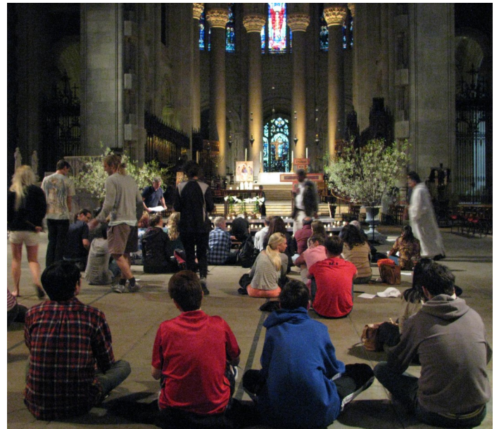
Youth and Young adults from CUMC at Taizé event at the Cathedral of St. John the Divine in NYC.

Kids will explore how to put their faith into action and we hope you will too!