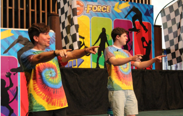
Things were always rockin' and rollin' in the Music Zone!

The power of imagination was in full force in the Creation Station.