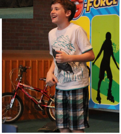
Shepherds guided the kids through the building. The "Cheetah Chow Zone" was always a favorite stop.