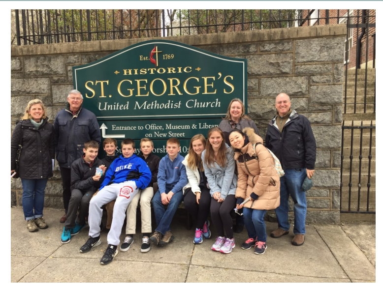
The Confirmation class hit the road for a little Philly Cheese Steak and a lot of American Methodist History. Ask us what we saw and learned at historic St. George's UMC!

youthchatumc@optonline.net * 973.908.4474