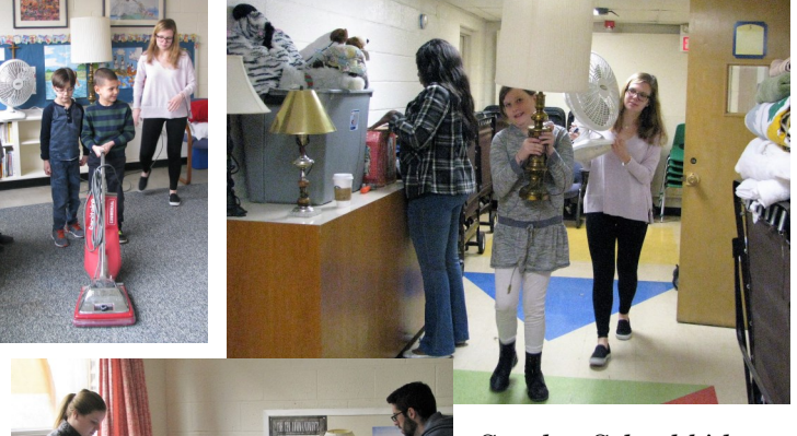
Sunday School kids and youth turned classrooms into bedrooms to welcome Family Promise guests.

After a lesson about the symbols of Holy Week, kids hunted for Easter Eggs prepared and hidden by the Junior Youth group.