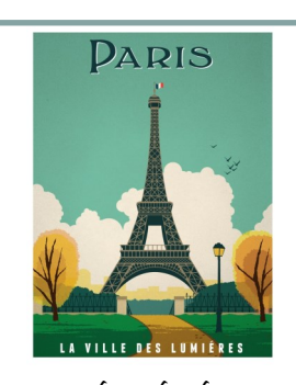
Mock Cocktails Appetizers, Pate, Brie, etc. Coq au Vin Carrots in butter Mashed potatoes Croissant Dessert

Rodda Hall will be transformed into a Paris night club! French music will fill the night! UMW Fundraiser to benefit RISE. $30 per person, $200 for a table of 8. Please make checks payable to UMW with "evening in Paris" in the memo.