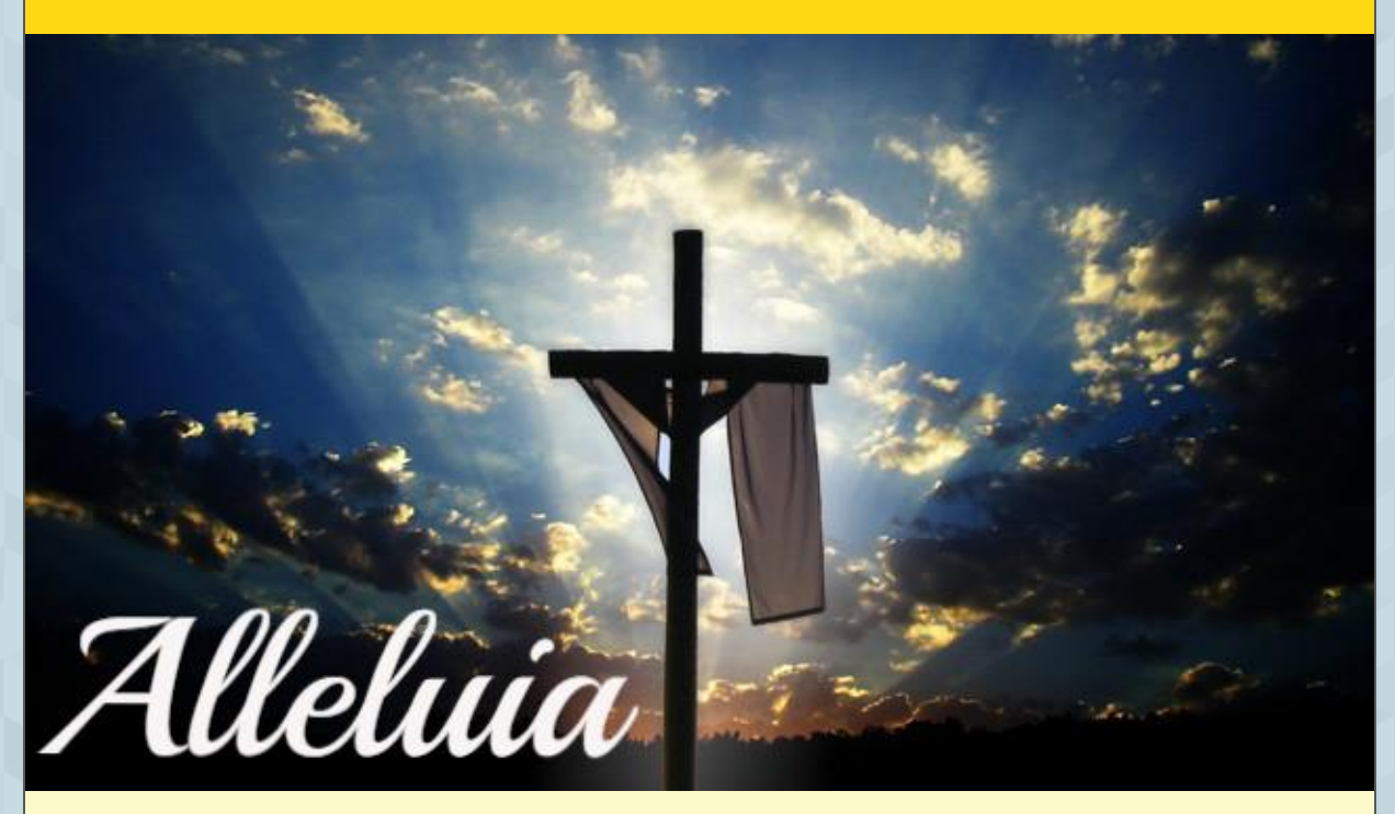
Remembering in our Prayers