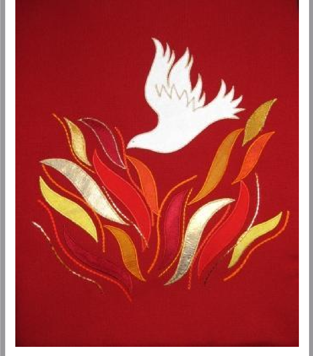
Pentecost Sunday, June 4, 2017 All are invited to wear red to our 9:00 and 11:00 a.m. Services.